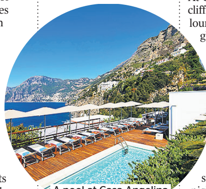
A pool at Casa Angelina on the Amalfi Coast

At Casa Angelina, a whitewashed cliffside hotel on the Amalfi Coast, lounges feature colourful Murano glass sculptures, and every bedroom includes an iPad to borrow during your stay. Afternoon sorbets and poolside prosciutto are offered before rooftop dinners of lobster spaghetti or pizza cooked in a wood-fired oven, and there's a spa and private beach to enjoy. The mercury tips 18C in April, throughout which the Luxury Holiday Company has savings of up to £350pp on four nights' B&B — now from £1,320pp, including flights and private transfers — if you book before February 29 (theluxuryholidaycompany.com).