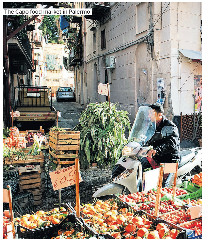
The Capo food market in Palermo

Lampedusa and Gioacchino, the duke, were very distant cousins and the pair grew close enough that Lampedusa legally adopted him. Gioacchino inherited the Palazzo Lanza Tomasi and, with Nicoletta, moved here permanently in 2007. She converted the dilapidated upper floors into 12 simple self-catering holiday apartments — known as Butera 28 Apartments — and